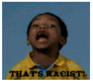
Figure 1. "That's racist" Meme https://www.youtube.com/watch?v=zyu2jAD6sdo

The image macro that is usually included in the "that's racist" memes features a child yelling with the caption, "That's racist!" (see Figure 1). For the most part, an animated GIF of this black child yelling is combined with or followed by politically incorrect or racially intensive images, commercials, online comments, etc. An example is the juxtaposition of Figure 1 with a video clip of a Disney movie considered to be racist.<sup>5</sup> In this case, the "that's racist" meme can be understood as a type of jest to point out racism which is often seen in our everyday lives and media.