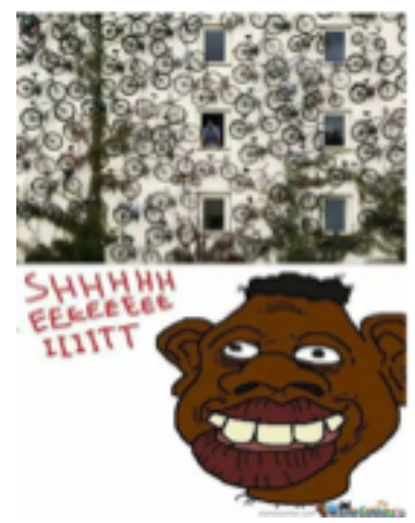
Figure 3. Who put bikes like that? http://www.memecenter.com/fun/1782141/who-put-bikes-like-that

enterprise inasmuch as it works through the politics of difference" (p. 119). Difference itself is not a problem. However, race as a field of representation needs to be challenged since Whiteness is normalized. This is also connected to the Black/White binary that is widely accepted in racial discourse. Under the Black/White binary, Blackness is often depicted as evil, irrational, and uneducated in contrast to Whiteness. Ladson-Billings (2005) contends that the issue of the Black/White binary is "the way everyone regardless of his/her declared racial and ethnic identity is positioned in relation to Whiteness" (p. 116). For example, Figure 3 implies that the Black man is thinking about stealing the bike by juxtaposing images of many bikes hanging on the wall and a Black man saying "SHHHHHEEEEEEEIIIITT." Of all of the memes that I collected, more than ten described African Americans as committing larceny; they often depict bikes and people wearing masks or running away. The images of black masks and the act of running away connotes the crimes committed by African Americans. Some memes also depict Mexican Americans as illegal immigrants by juxtaposing a picture of people hiking and using phrases that imply illegal border crossing.<sup>7</sup> This racially discriminatory representation also supports cultural racism, which blames the culture of the minority as a cause of inequity and a strategy of colorblindness (Bonilla-Silva, 2006).