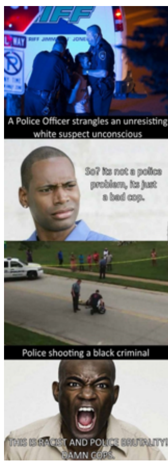
Figure 5. It's only racist if it's a Black guy, just like its only terrorism if it's a Muslim http://www.memecenter.com/fun/5162071/its-only-racist-if-its-a-black-guy-just-like-its-only-terrorism-if-its-a-muslim

states that that police brutality is irrelevant to racial oppression, but rather reflects people's biased reactions. This is the strategy of "minimization of racism" which Bonilla-Silva (2006) describes as one frame of colorblind racism. In a similar vein, Figure 4 also shows the denial and misunderstanding of racism. Its title, "Racism is just a matter of perspectives," is a typical colorblind rhetoric, which reduces the systematic and institutional level of racial oppression to the matter of personal perspective.