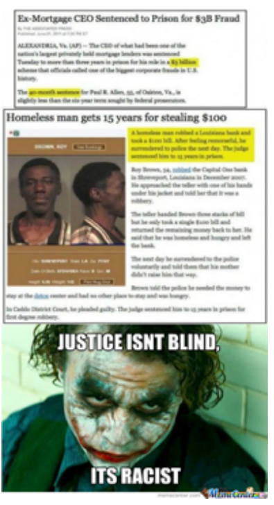
Figure 6. Justice isn't blind, it's racist http://www.memecenter.com/fun/1389757/are-they-even-serious

and a Black homeless man stealing 100 dollars. An image of the Joker with the catch phrase "justice isn't blind, it's racist" attracts attention with the purpose of raising a question about colorblindness. Though the meme does not provide enough background to judge the fairness of the legal cases, it is successful in questioning our so-called post-racial society. Many people responded to the meme by leaving numerous comments, including more memes with a surprised face or other evidence of racial inequity. From this perspective, the meme in Figure 6 raises awareness of racial issues and effectively challenges colorblindness.