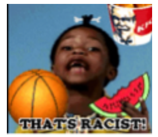
Figure 2. "That's racist" Meme https://www.youtube.com/watch?v=IVViqUNeKeg

Another type of "that's racist" meme carries typical racial stereotypes. Figure 2 shows a modified meme based on Figure 1; it adds images of a basketball, a slice of watermelon, and a box of KFC fried chicken. These images are associated with racial and cultural stereotypes against African Americans. I also found similar forms of memes showing racial and ethnic stereotypes against Mexicans, Muslims, and Asians. For example, "That's waisis" memes mock the accent of Asian people. One might think this genre of memes is a mere joke that will barely affect the public's mindset or lead to negative consequences. However, I found numerous comments about negative